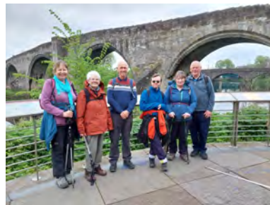
A picture from our walk in May, beside the River Forth to Old Stirling Bridge