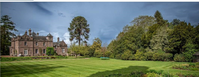
Entry £5 adults, children free Tea, coffee, cakes - donations Children's treasure hunt, croquet