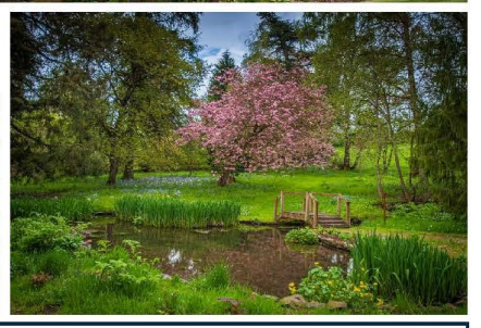
Traditional 19<sup>th</sup>-century garden of 5 acres. Magnificent mature trees (six classified as remarkable), lawns with herbaceous borders, rhododendrons/azaleas, newly planted rose pergola, wildflower areas, kitchen garden, orchard, ornamental ponds, pinetum.