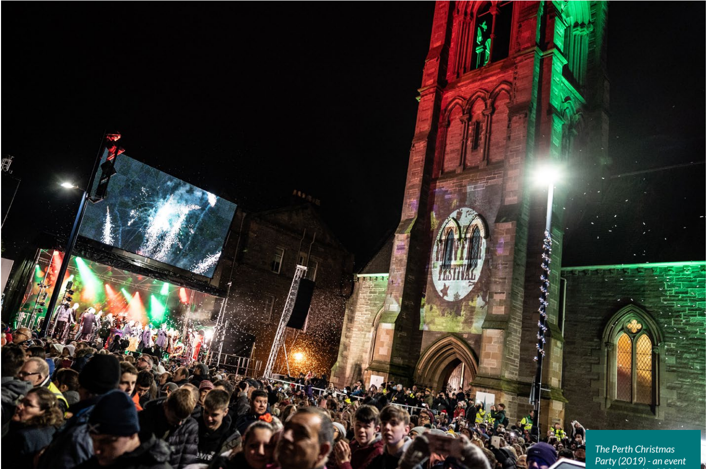
The Perth Christmas Party (2019) - an event sadly missed in 2020