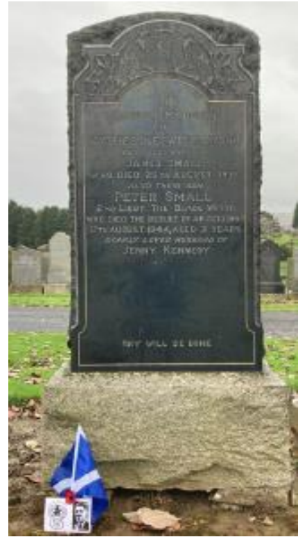
Peter Small - Died 17/8/44