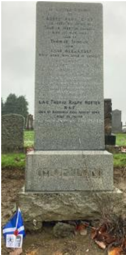
Thomas Ralph Morton - Died 22/8/40