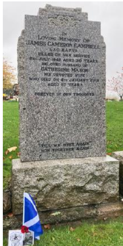
James Cameron Campbell - Died 2/7/42