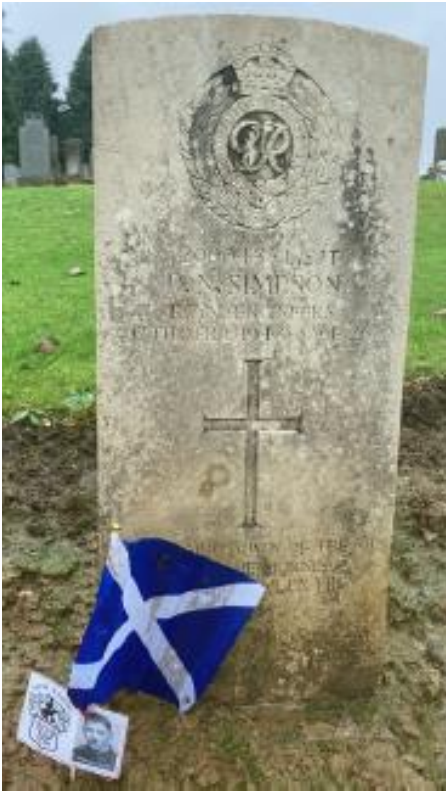
D.N.Simpson - Died 17/4/43